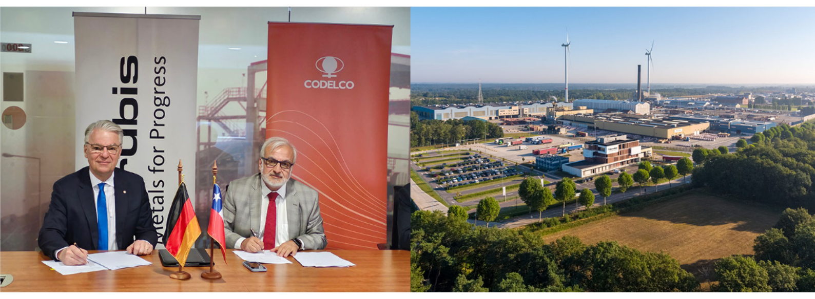
Cooperation agreement signed with Codelco