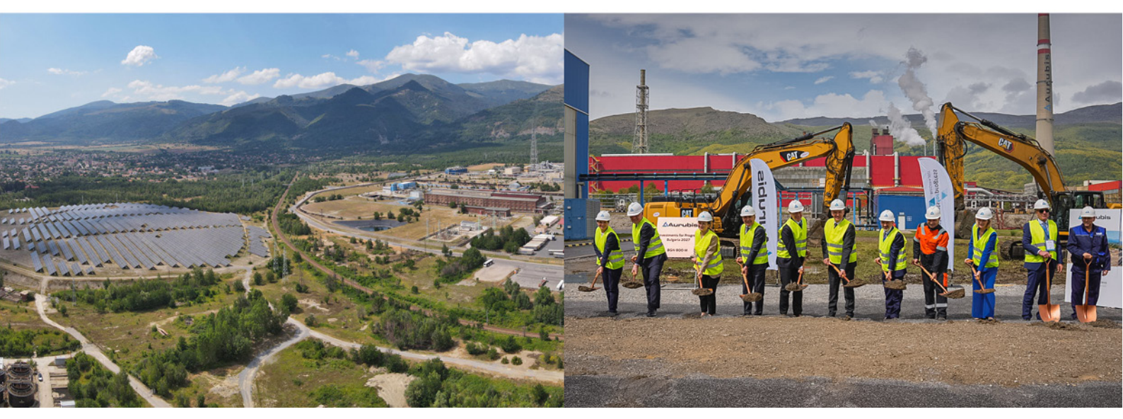
Solar park expansion at the Bulgarian site