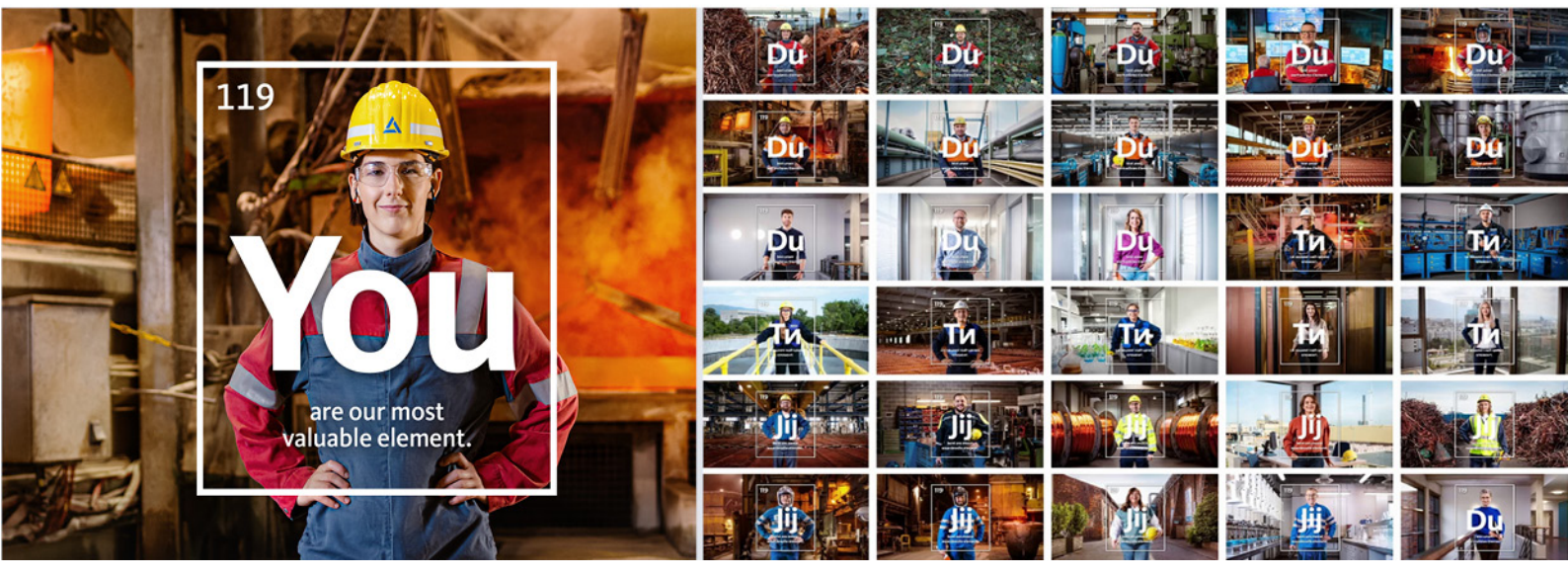
New Aurubis employer brand