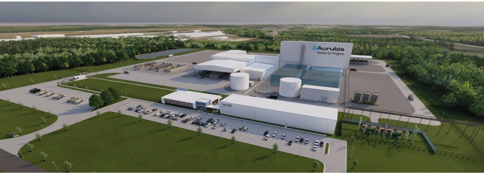
This visualization demonstrates what Aurubis' new US recycling plant will look like.

to now. On November 10, 2021, Aurubis announced that it would build the first secondary smelter specializing in multimetal recycling in the US for about € 300 million. With the technology planned for Aurubis Richmond, USA, Aurubis will become a forerunner in multimetal recycling in the US. A position that Aurubis already holds in Europe. Aurubis Richmond will process about 90,000 t of complex recycling material into 35,000 t of blister copper each year. The start of construction is planned for summer 2022. The plant should be commissioned in the first half of 2024. The expected operating EBITDA of the plant will be about € 80 million per year starting in fiscal year 2025/26.