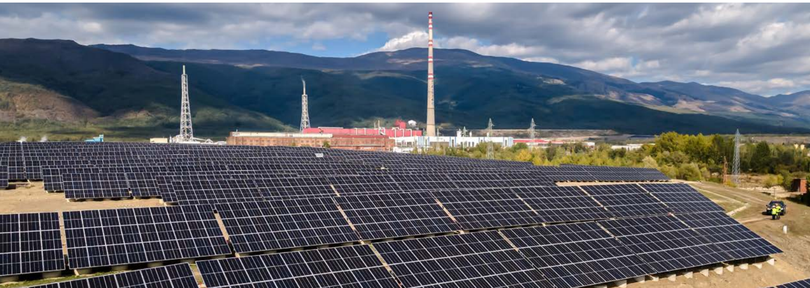
Internal energy production: In Bulgaria, we're building the largest internal company solar plant.