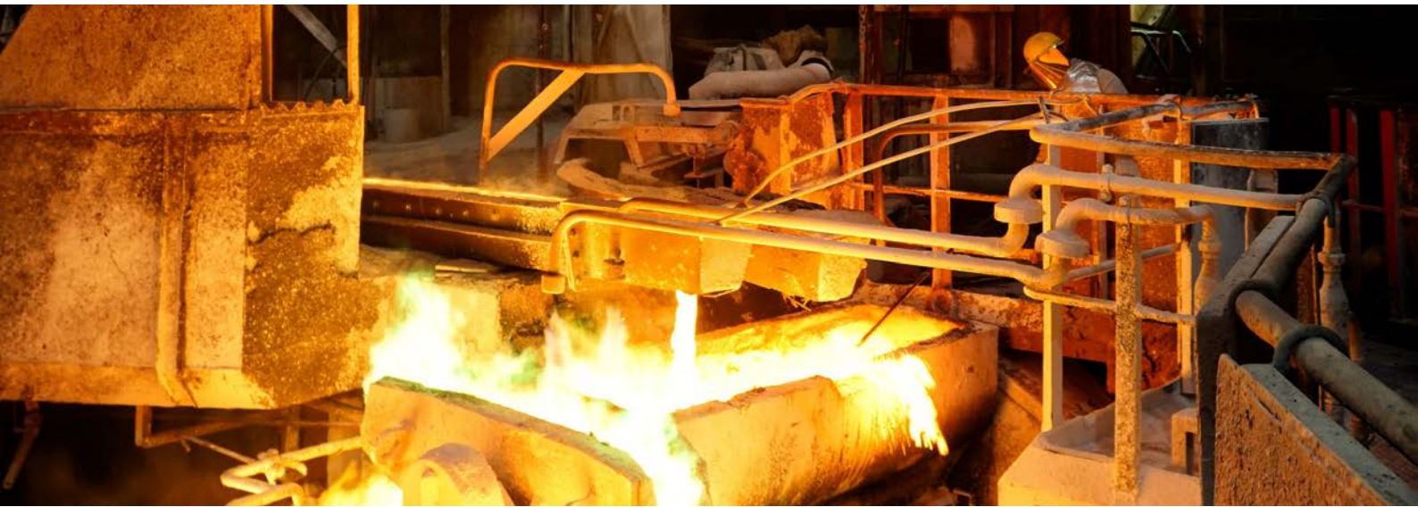
Metal Refining & Processing